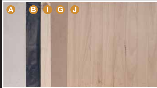
Traditional solid timber floor (Concrete slab)

Note: Installation on timber sub floor (i.e. yellow tongue) delete steps B,C