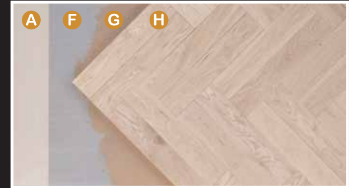
Traditional parquetry timber floor (Concrete slab)

Note: Installation on timber sub floor (i.e. yellow tongue) delete step B